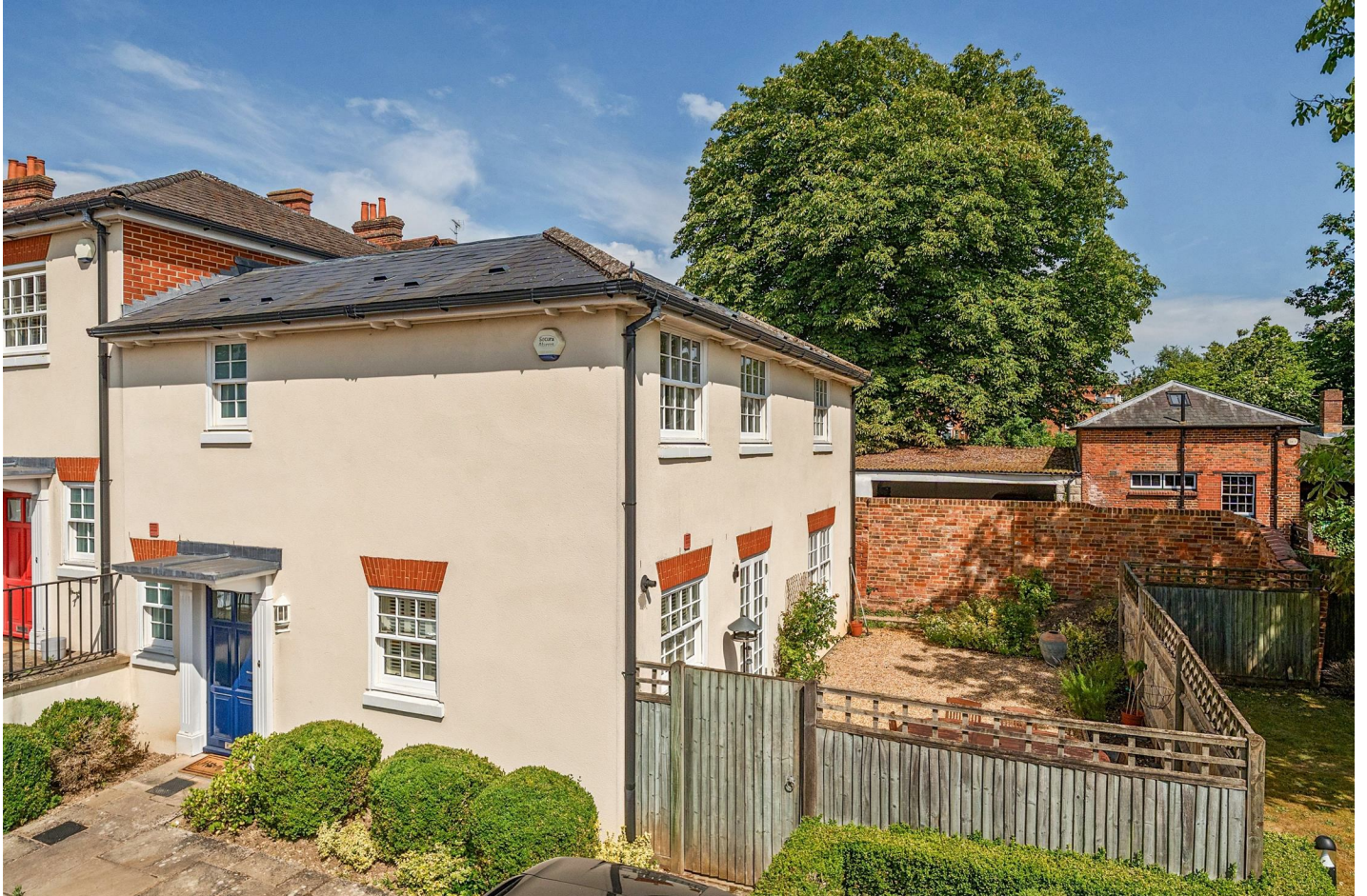
The Coach House 9 Hulbert Gate, Shute End Wokingham Berkshire, RG40 1BS OIEO £600,000 Freehold